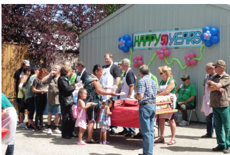
Knights & friends serving up a tasty meal