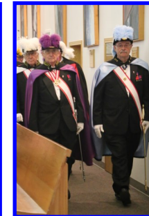
4th Degree Honour Guards