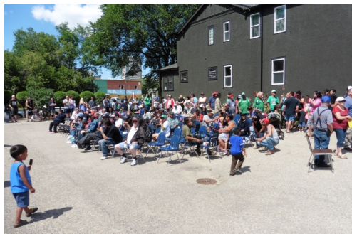
Taking a seat after getting their meals