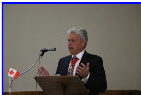
State Deputy Brian Schatz