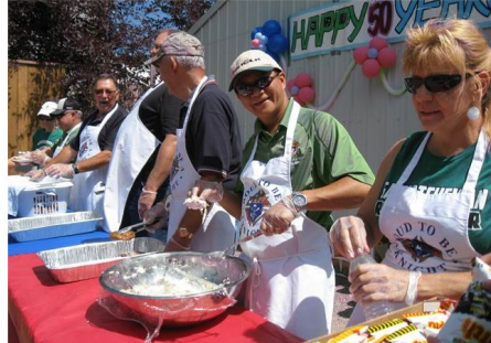
Having fun & looking good too!