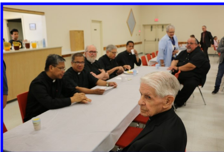
Priests from various parishes