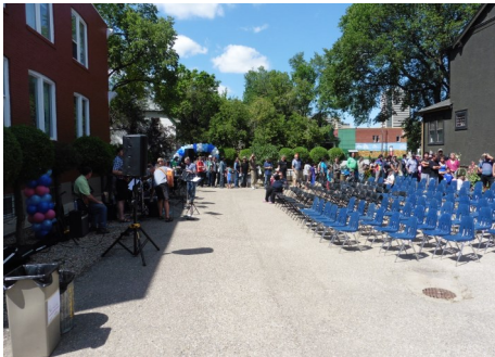
370+ clients lining up for the BBQ