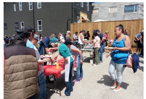
Going through the line-ups